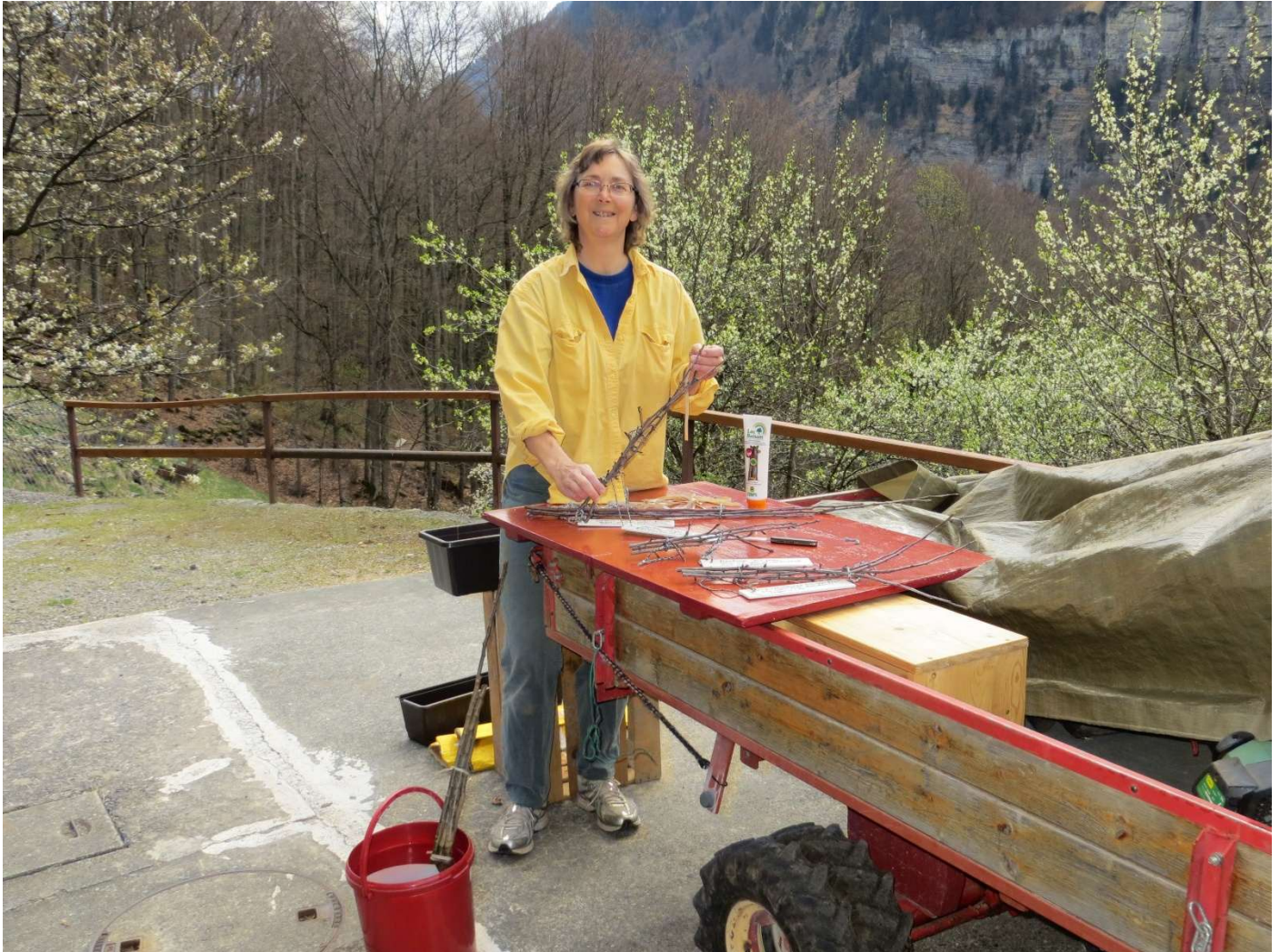
Grafting fruit trees on our permaculture farm in Gündlischwand, Switzerland, 2014.

Subscribe to my free newsletter under “contact” www.tanyaswriting.com for my April 26 article Save a Tree .